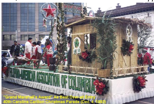
"Grand Marshall's Award" As Best Over-all Entry 40th Carolina Carillon Christmas Parade (Dec. 4, 1993)

Dec. 4, 1993 FAAGC's " Christmas in the Philippines " float wins the Grand Marshal's Award as best over-all entry in the 40th annual Carolina Carillon , South Carolina's premier holiday parade.