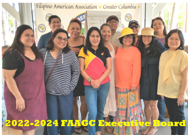
2022-2024 FAAGC Executive Board