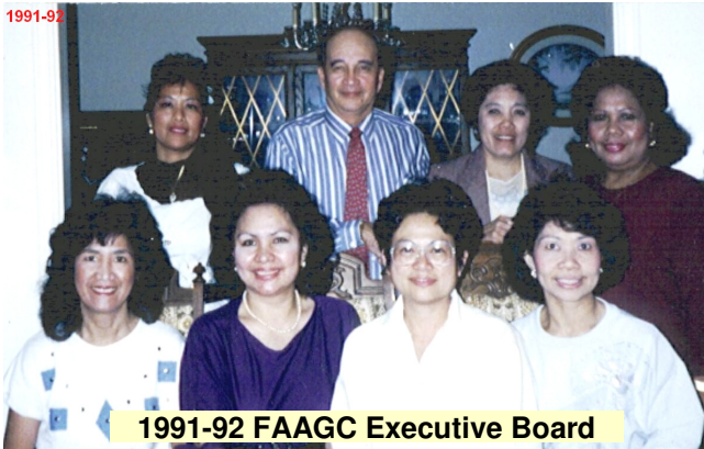
1991-92 FAAGC Executive Board