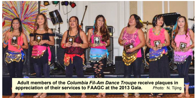
Adult members of the Columbia Fil-Am Dance Troupe receive plaques in appreciation of their services to FAAGC at the 2013 Gala.