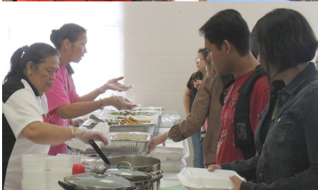
Filipino Food Sale November 16, 2013