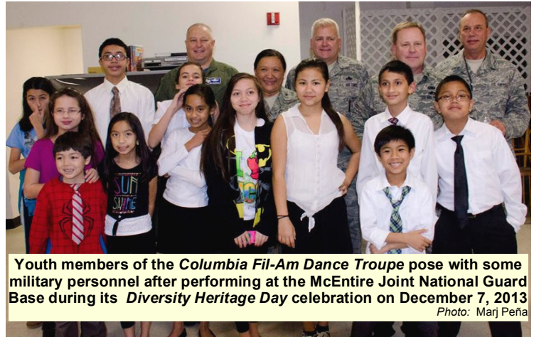
Youth members of the Columbia Fil-Am Dance Troupe pose with some military personnel after performing at the McEntire Joint National Guard Base during its Diversity Heritage Day celebration on December 7, 2013