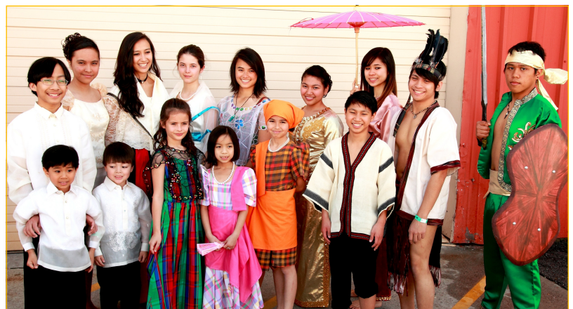
At the 2011 Columbia International Festival held April1-3 at the State Fairgrounds, Fil-Am volunteers have their kodakan moments while setting up the flowery Flores de Mayo -themed Philippine booth (left) and before participating in the International Fashion Show (above).