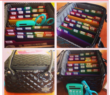
Janet Harris' Coupon Organizing Kit

Go ahead — there is no shame in couponing. That crown means you are fiscally-responsible, math savvy and a very organized individual. ❖