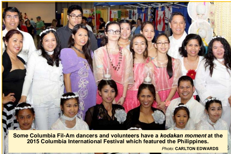
Some Columbia Fil-Am dancers and volunteers have a kodakan moment at the 2015 Columbia International Festival which featured the Philippines.