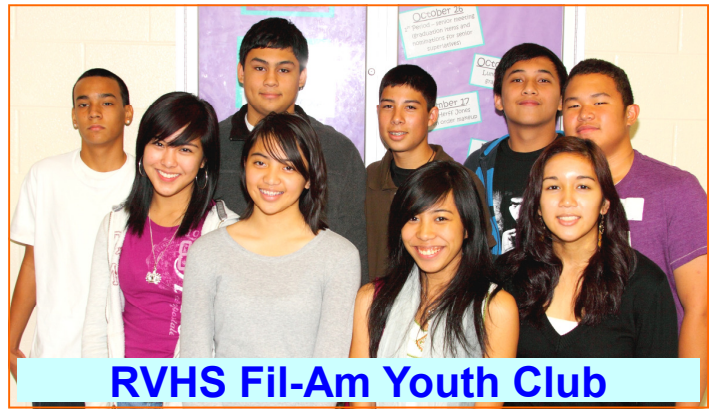
RVHS Fil-Am Youth Club

DVDs of the 2009 Fil-Am Gala can be ordered for $15 each from Alan Geoghegan (803) 787-5255 (803) 318-6659 alan@medianetsc.us