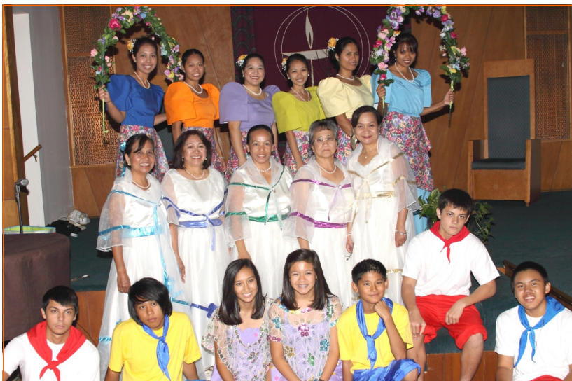
▲ The Columbia Fil-Am Cultural Dance Troupe performers take time to pose before performing the bulaklakan, Jovencita, and tinikling dances during the International Day of Peace celebration held at the Unitarian-Universalist Fellowship of Columbia on September 20, 2009 .

Last year's gala raised funds for the Philippine Red Cross to benefit Philippine calamity victims. Previously, the FAAGC gala benefited four Philippine orphanages and child welfare institutions. ❖